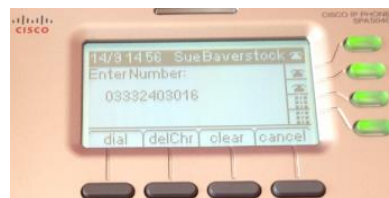
Press Dial to place the call

Remember, you don't need to dial 9 first in order to get an outside line with Horizon.