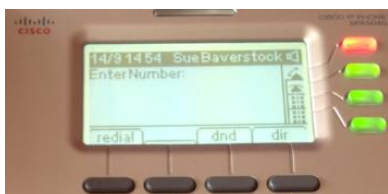
Dial your number