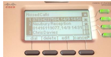
Highlight the number

Then press Dial to call or Option to delete. Use EditDial to change the number before calling.