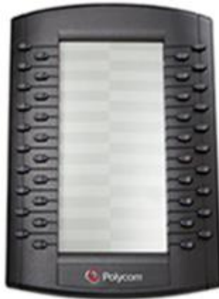
VVX Monochrome Expansion Module

It will give you an overview of your device, and walk you through tasks so you can successfully use it to perform basic and advanced functions.