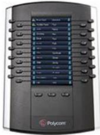
VVX Colour Expansion Module

This user guide will help you to navigate and use your new VVX Expansion Module. It will give you an overview of your device, and walk you through tasks so you can successfully use it to perform basic and advanced functions.