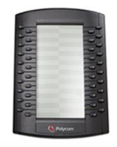
VVX Monochrome Expansion Module

It will give you an overview of your device, and walk you through tasks so you can successfully use it to perform basic and advanced functions.